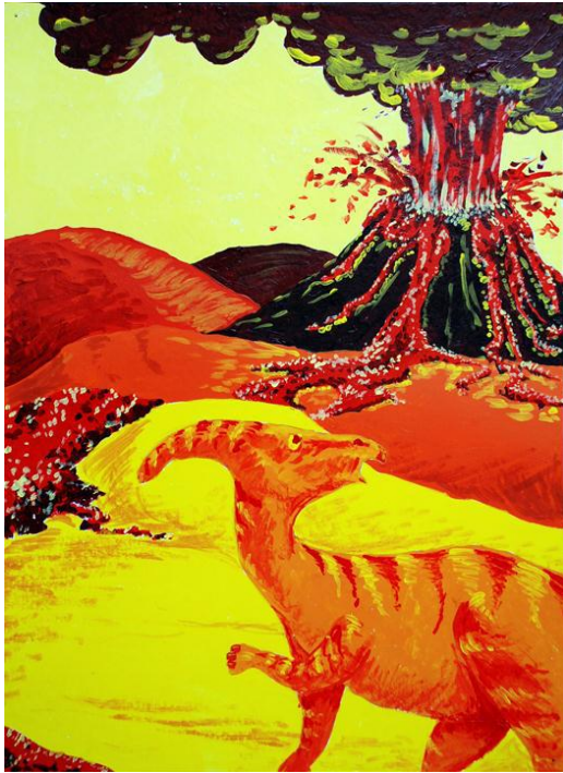
Anita. Warm Hue , 2011, Acrylic on paper, 11x14 inches

Create cool and warm image. It can be representational or non-representational. Use the colors to express the feeling you want to convey.