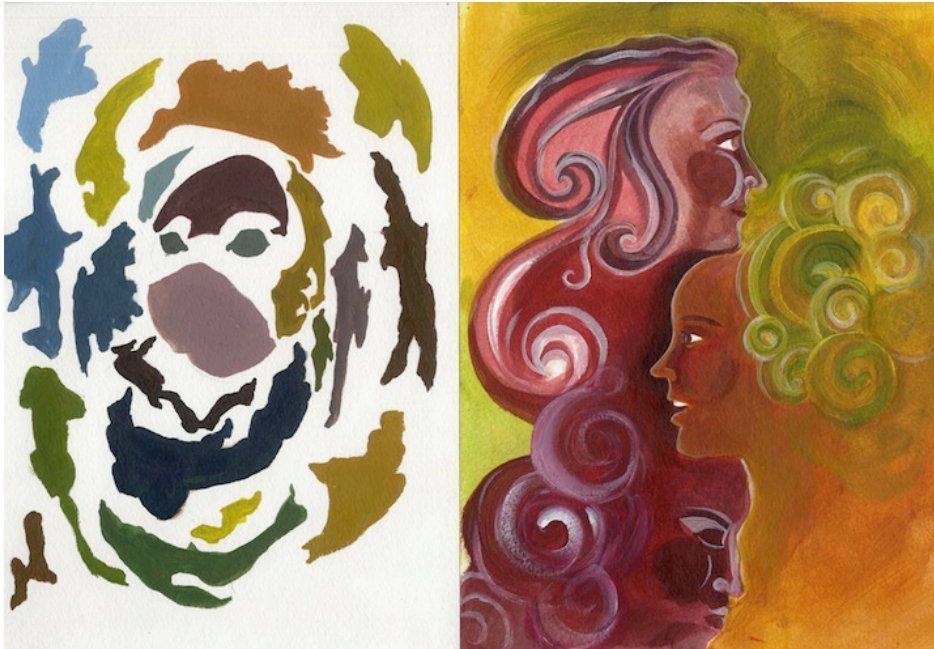
Elizabeth King. Neutral , Acrylic on paper, 2013, 9x12 inches Ferryn Nowatzki. Neutral , Acrylic on paper, 2013, 9x12 inches

Create an interesting design and fill with Neutral Colors. You can use neutral color from your 'Properties of Color' exercise as a guide and adjust or modify color to meet your need.